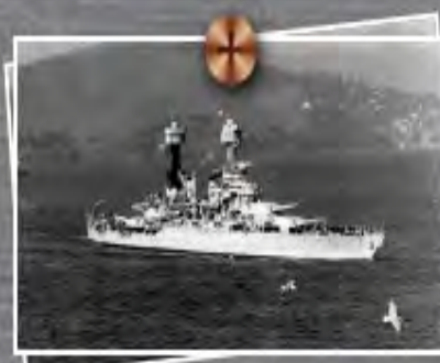
USS West Virginia