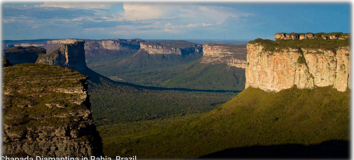
Chapada Diamantina in Bahia, Brazil