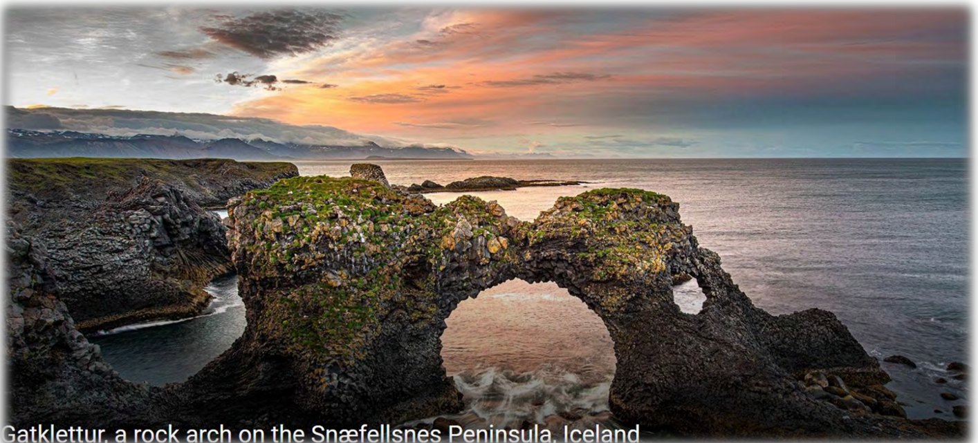
Gatklettur, a rock arch on the Snæfellsnes Peninsula, Iceland