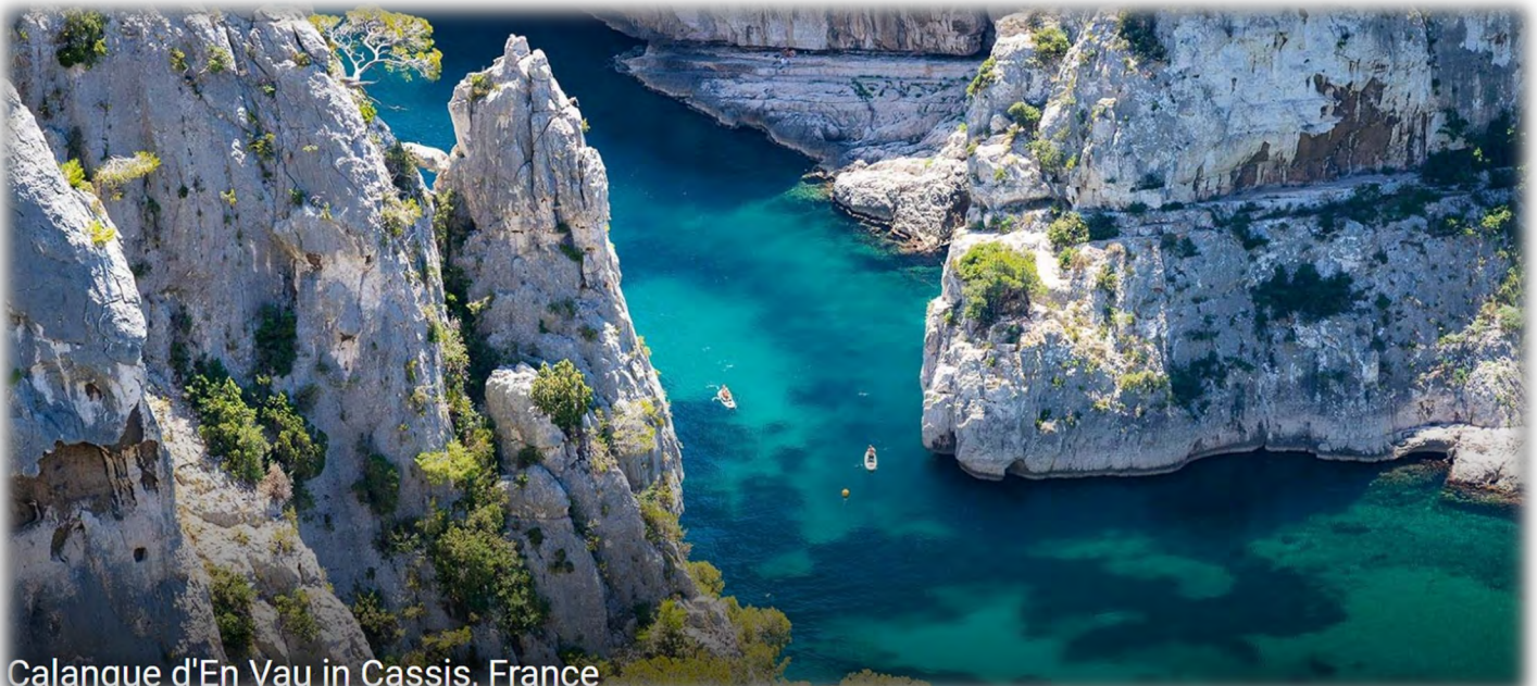
Calanque d'En Vau in Cassis, France