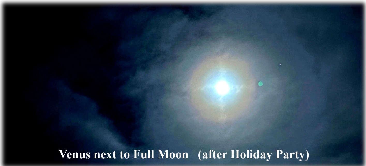
Venus next to Full Moon (after Holiday Party)