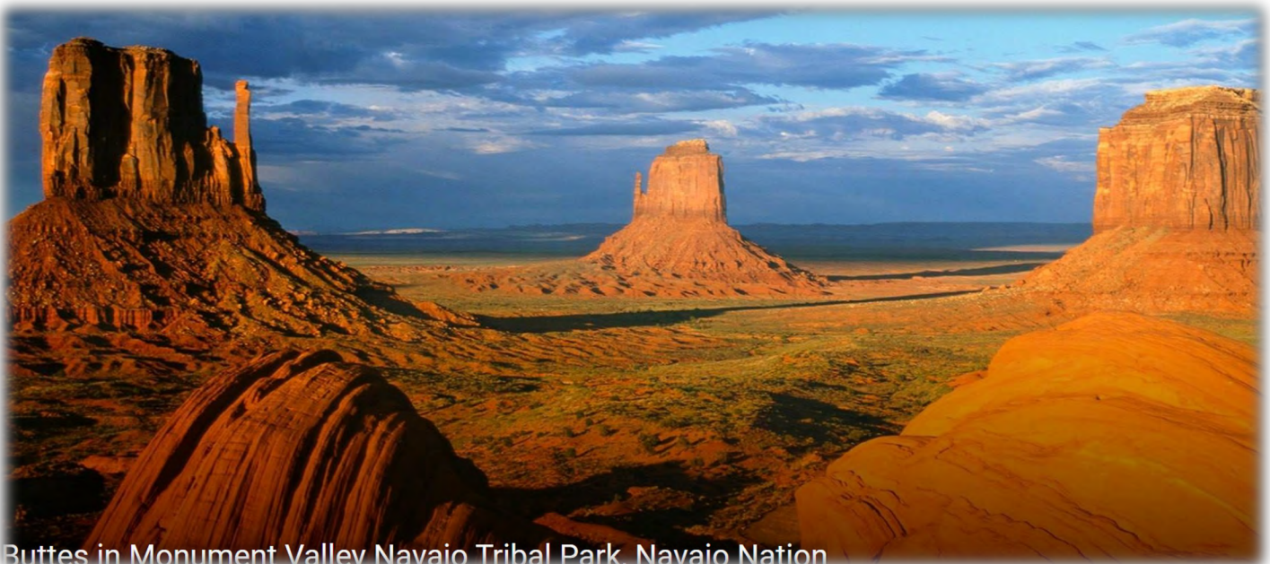
Buttes in Monument Valley Navajo Tribal Park, Navajo Nation